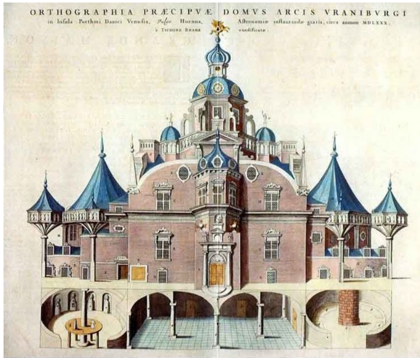
Uraniborg main building. Copper etching from Blaeu's Atlas Major, 1663.