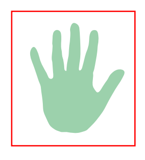
Motif and Base tile